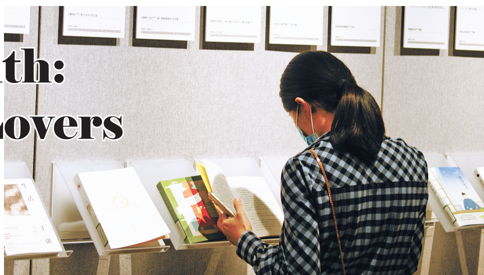
The themed exhibition "who is reading" at Ningbo Library.

Every visitor to the exhibition can form their answers to imbue the act of reading with their unique, personal