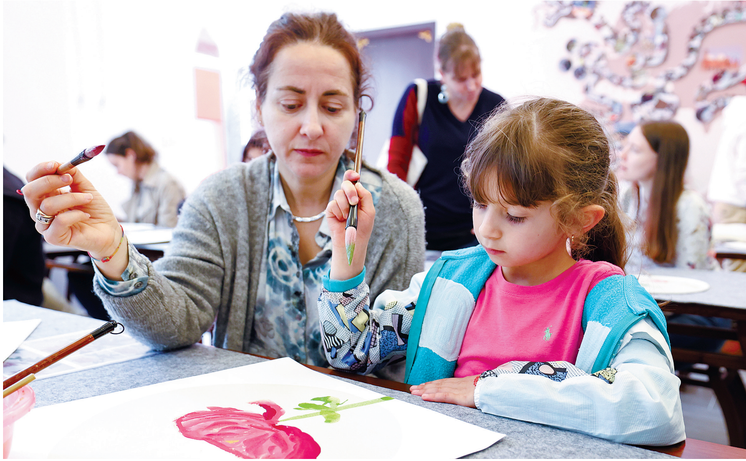
An elegant peony forms under the brush tip of the foreign friends.