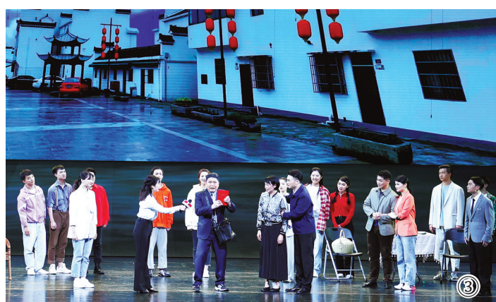
①Choral performance Ode to the Motherland . ②The dance Cotton Girl . ③The short play Response in Spring .