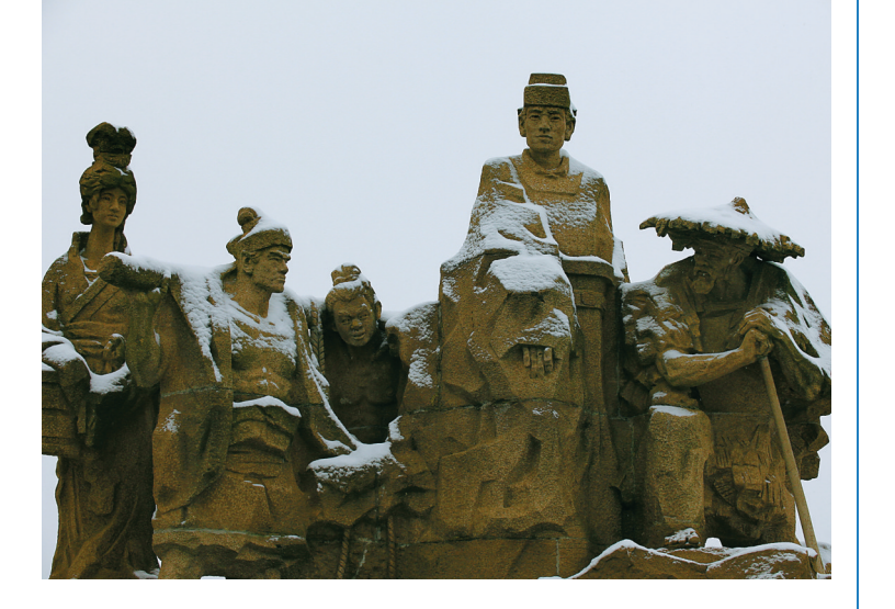
Statue of Wang Anshi's water-control. / 王安石治水雕像。

虽然之后王安石得到了升迁, 并且没有再回到鄞县,但是这里的 很多庙宇,如实圣庙、忠应庙,以 及很多其他建筑,都与他有关。