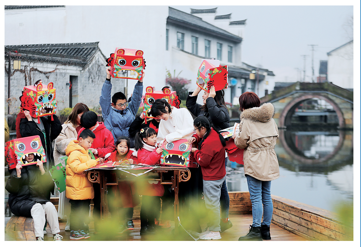
Making tiger hats to celebrate the festival here. /制作虎头帽庆祝节日。

如今,这里吸引了许多人前来 游玩。在虎年伊始,市民游客在这 里猜灯谜、包汤圆、制作虎头帽, 为老宅增添了热闹的节日氛围。