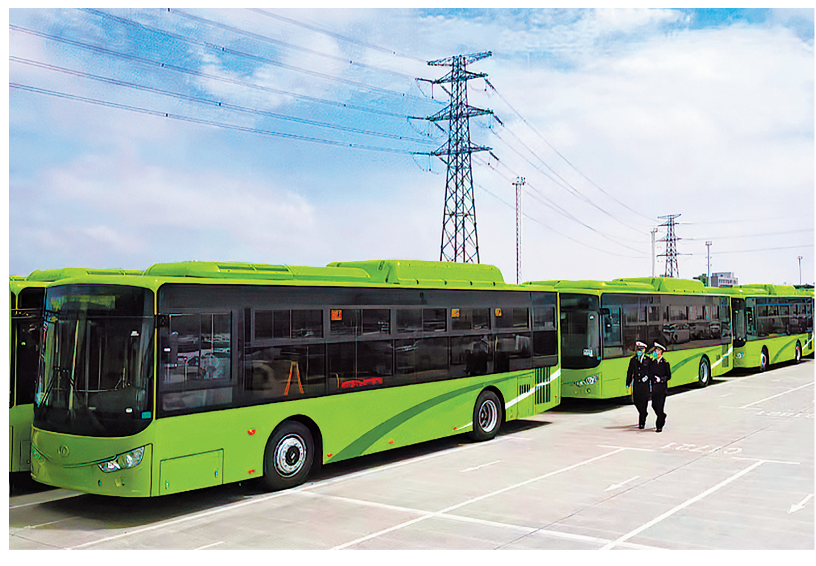
Chinese-Made Buses, to be exported to Mexico.

"We have a lot of buses. The refilling took about four or