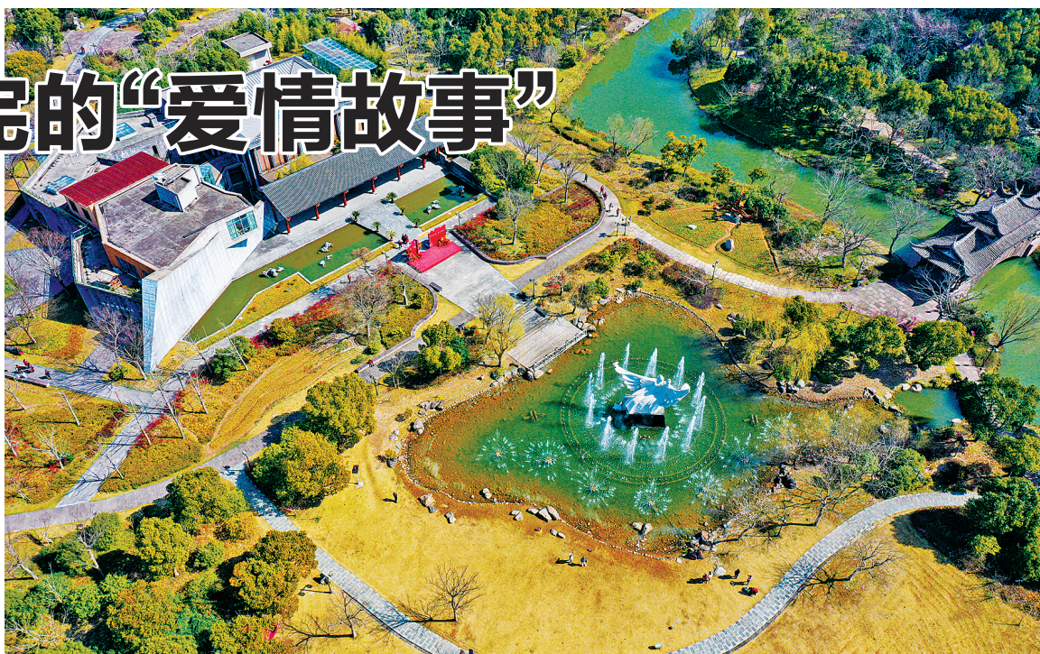
Ningbo's Liangzhu Cultural Park. /宁波梁祝文化公园。

Over the years, the Park has hosted numerous events celebrating the Butterfly Lov-