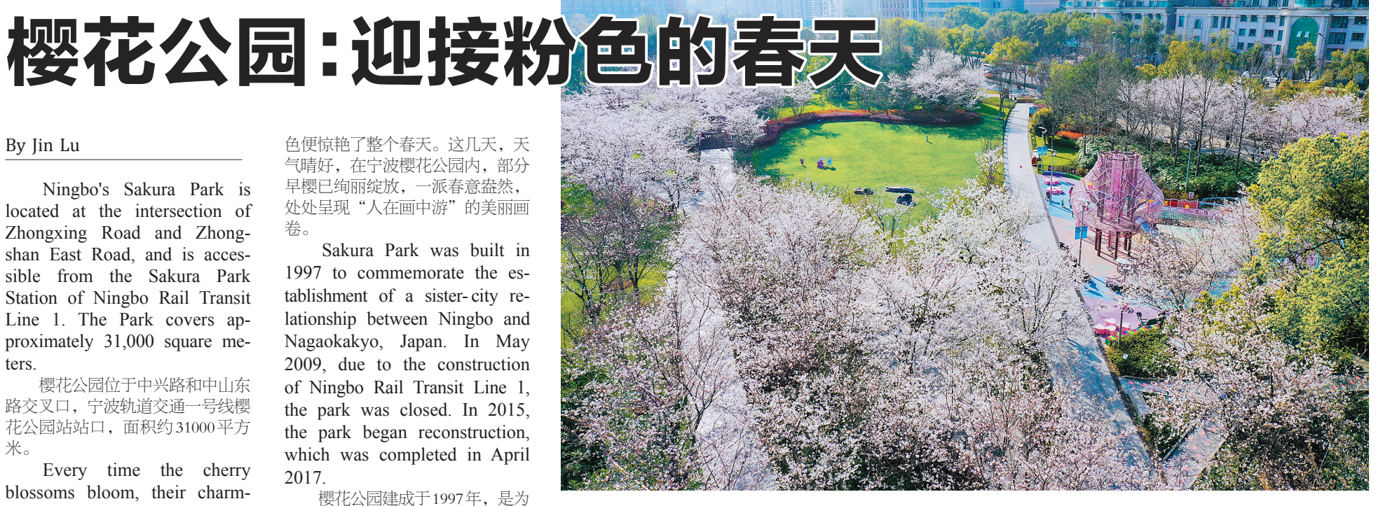
Early-blooming trees in Ningbo's Sakura Park. /宁波樱花公园内早樱绽放。

份完成重建。 Sakura Park cultivates 26 cherry blossom varieties, including the Somei Yoshino, the