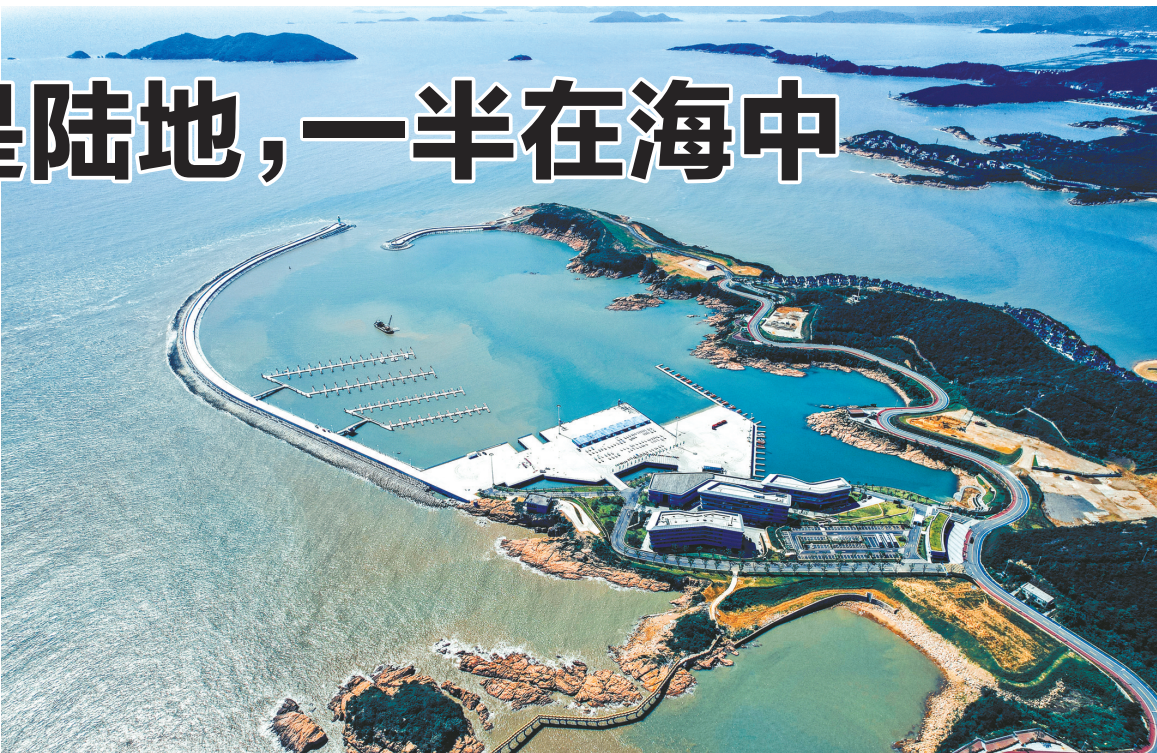
The Asia Sailing Center. /亚帆中心。

The project covers a land area of 39 acres and a sea area of 115 acres. The main construction content includes a 16,000-square-meter athlete center,