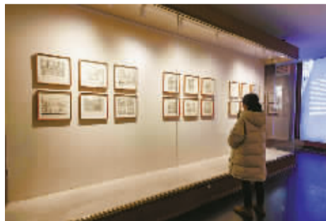
Duo Exhibition at Tianyige Museum

the head of the M.I.M.A program (Art Materials and Memory Science) at the Faculty of the Fine Arts in the University of Barcelona. He also serves as a committee member of the Art Department of the Education Ministry of the Catalan Govern-