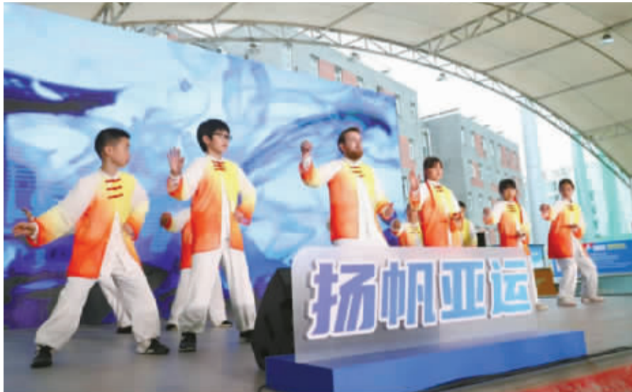
A Tai Chi performance by the Ningbo Georgia School (GSN)