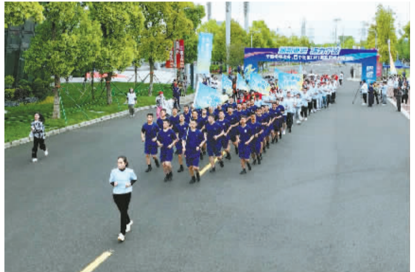
Asian Games gold medalist Wang Chengyi led a run.

It is a spring relay race. The citizens of Ningbo are eager to welcome the upcoming Asian Games Hangzhou 2022. This co-host city for the Games in Eastern China is listed as "The City of Olympic Champions", renowned for its record in nurturing five gold medalists at the 2020 Tokyo Olympics.