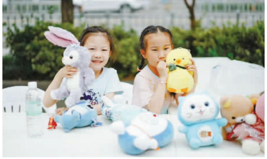
Kids showcased their beloved toys.

On the first scorching weekend of summer 2023 in this coastal city of Eastern China, the warm hearts of youngsters outperformed against the soaring temperature.