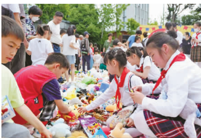
The festival drew crowds of visitors.