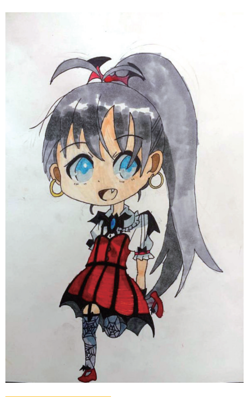
Pretty Girl 鄞州区五乡镇中心小学403班 王丹妮(证号1007758)

Hello, I' m Cherry. This is my bubble map. The bubble map is about wild animals. They are tigers. They have got tails. They are giraffes. They have got mouths. They are crocodiles. They have got tails. They are elephants. They have got long noses. They are hippos. They have got hands. They are snakes. They have got long bodies. They are monkeys. They have got arms.