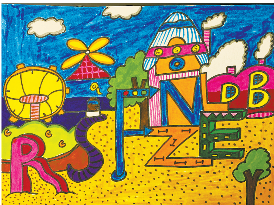
Letter Park 海曙区高桥镇中心小学 303 班 翁语晨(证号 1006845) 指导老师 毕维嫩

镇海区艺术实验小学 303 班 葛昊杰(证号 1001862) 指导老师 柳红波